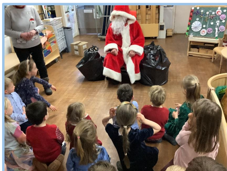
Anticipation - what is in the black bags?