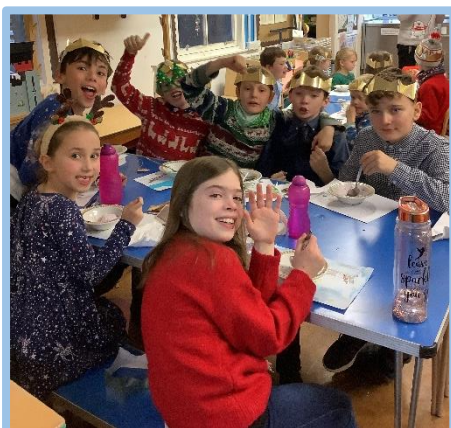
What a tasty lunch

P7 took responsibility for organising the games and I think everyone who was at the party would agree that they did a fantastic job, making sure everyone, felt included and could really enjoy the party. The day was rounded off by a very special visitor, who came to deliver some early Christmas good wishes and parcels.