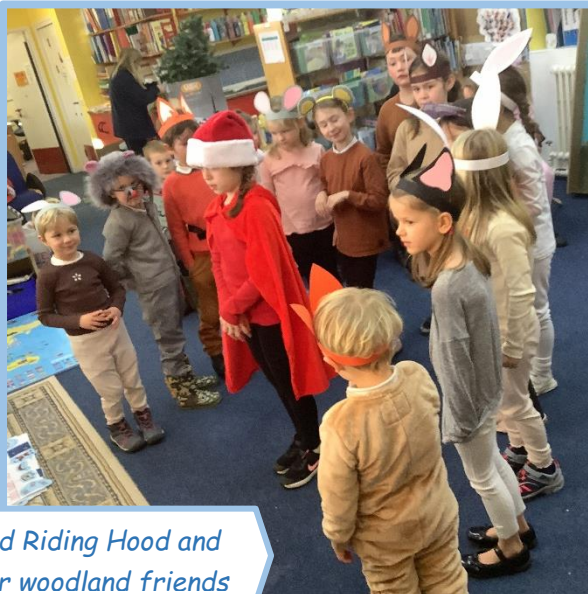
Red Riding Hood and her woodland friends

I think everyone would agree that the final performance was just brilliant. There were quite a few of us in the hall that day that felt quite emotional at all the children had achieved. We were all very proud of each and every one of them and I hope that they remember the skills and the confidence they displayed during the performance – the question is, how do you follow that??