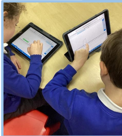
Empty number line calculations with the help of the ipad