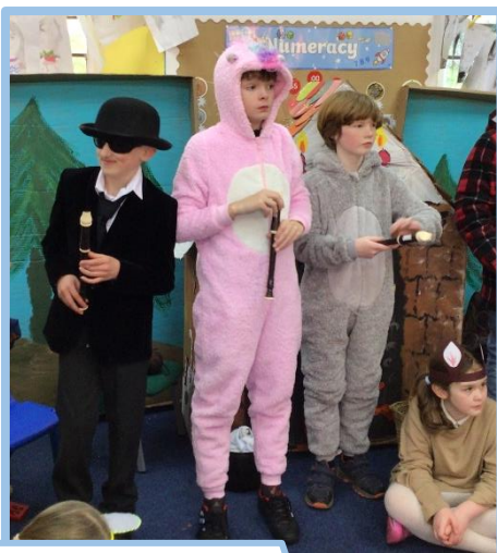
Getting ready to go