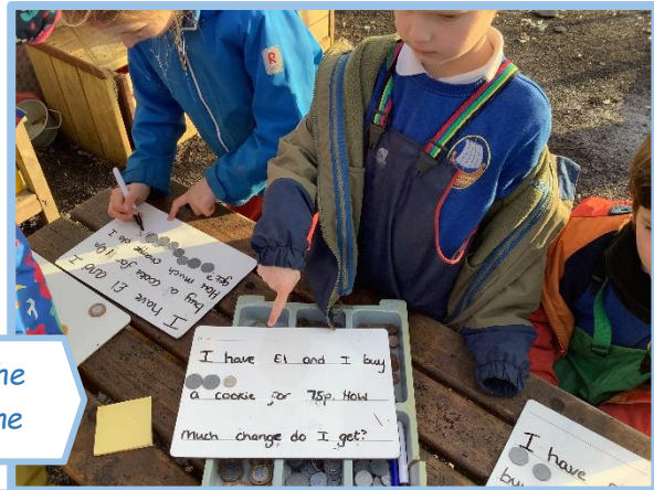
Numeracy in the loose parts zone