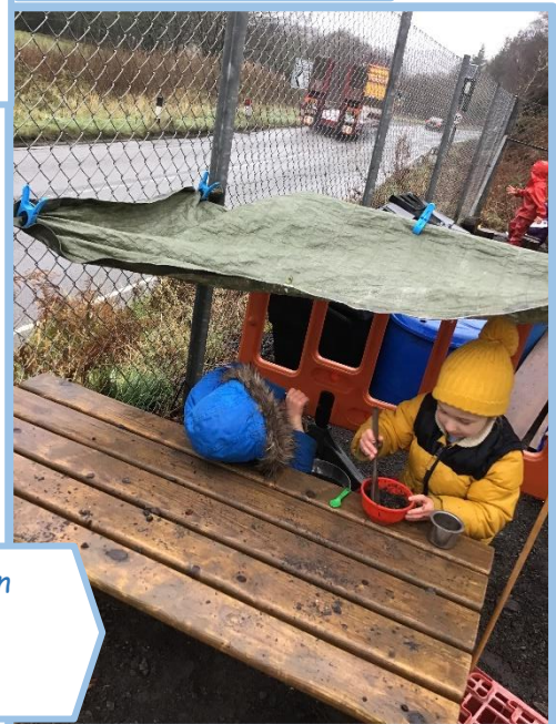
Creating in the loose parts den