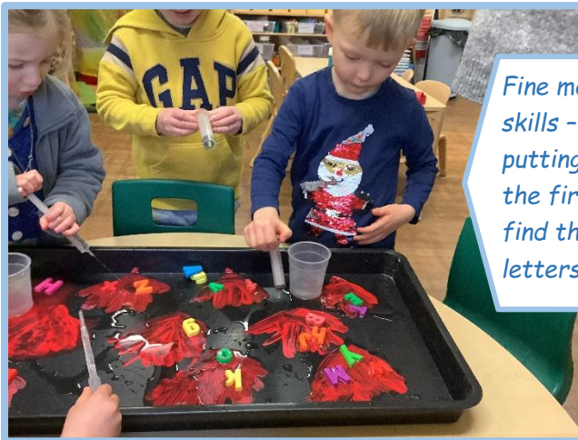
Fine motor skills - putting out the fire to find the letters

The ELC is a very exciting place to be with new adventures and skills to be practised every day. Here is just a few pictures of some of the learning that happens on a daily basis.