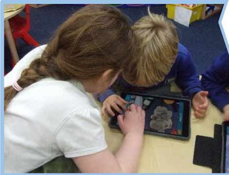
Language learning with technology