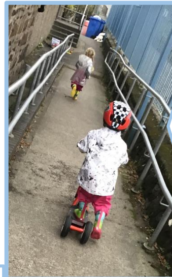
Scooting and running - improving our big motor skills