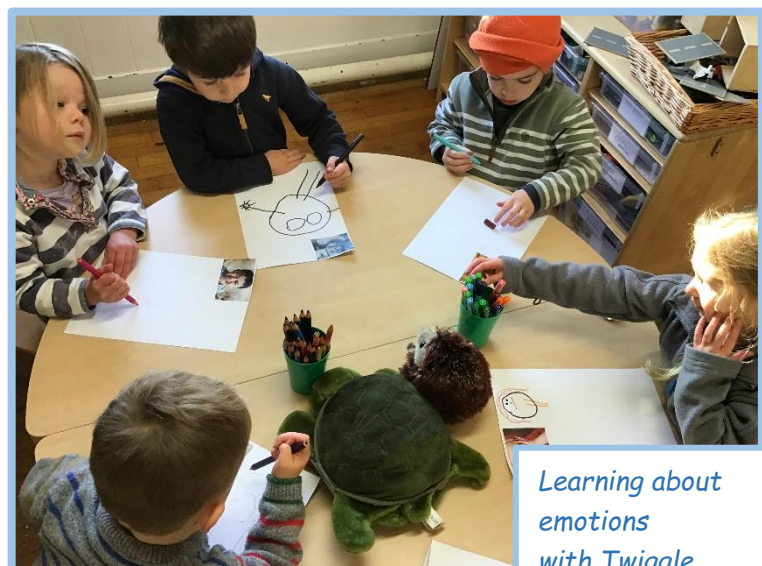
Learning about emotions with Twiggie.