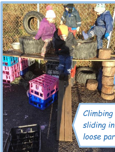
Climbing and sliding in the loose parts