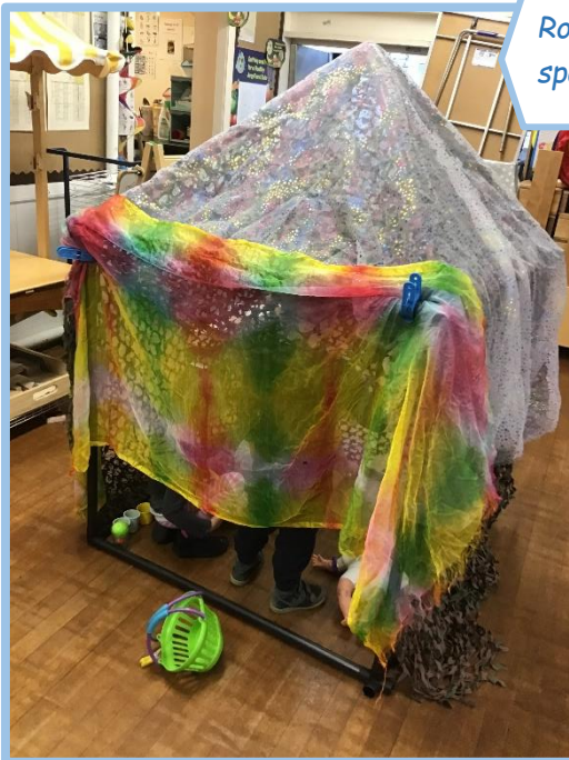
Role play in the sparkly den