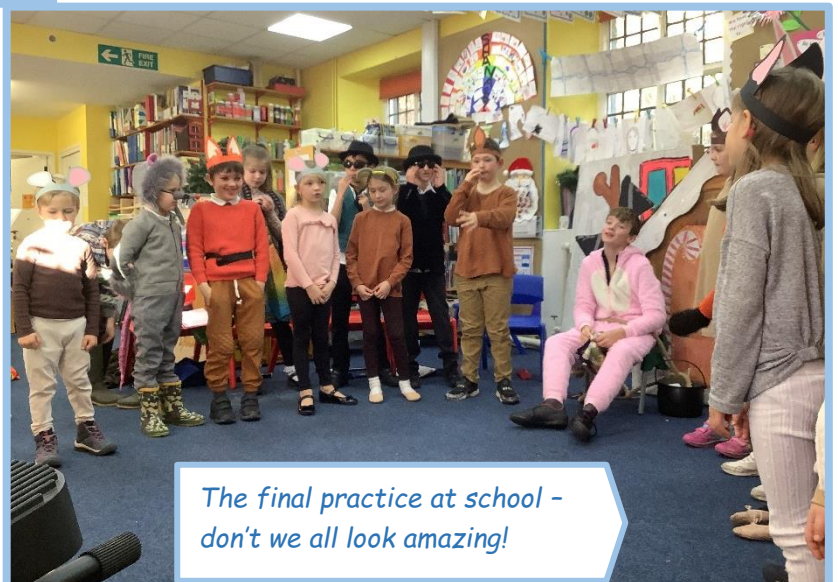
The final practice at school - don't we all look amazing!