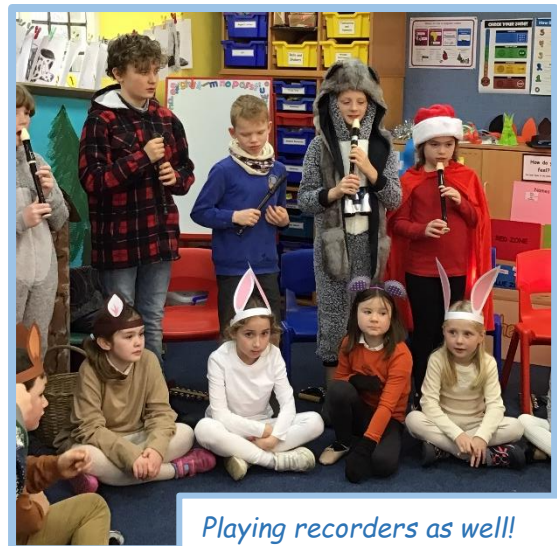
Playing recorders as well!