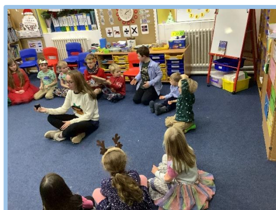
When the music stops.....