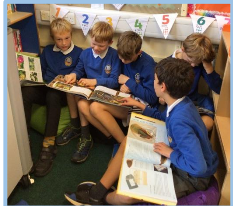
Reading to find things out